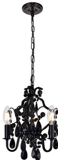
Black Item No:LD5019D9BK